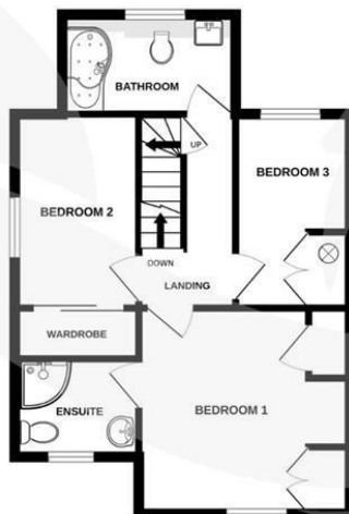
1ST FLOOR 40.4 sq.m. (435 sq.ft.) approx.